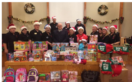
Donations of toys by CBS Kinsmen