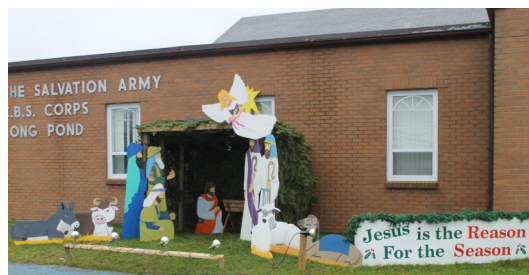
Visit the manger at our church