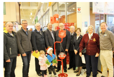
Launching of Christmas Kettles