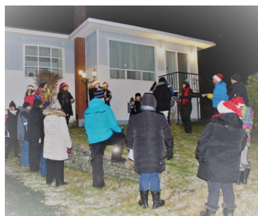
Christmas Carols to sick & shut-in