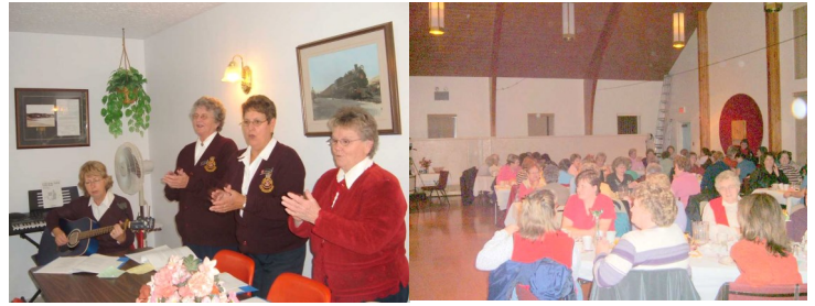
The above pictures are: left—Community Care Workers doing a service in a home in Holyrood.