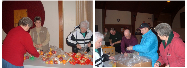
People of CBS Corps packing Sunshine Bags for the Homes