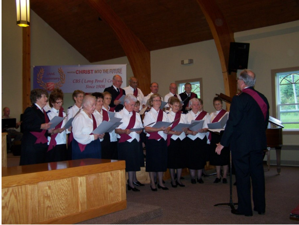
Fifty Plus Vocal Group