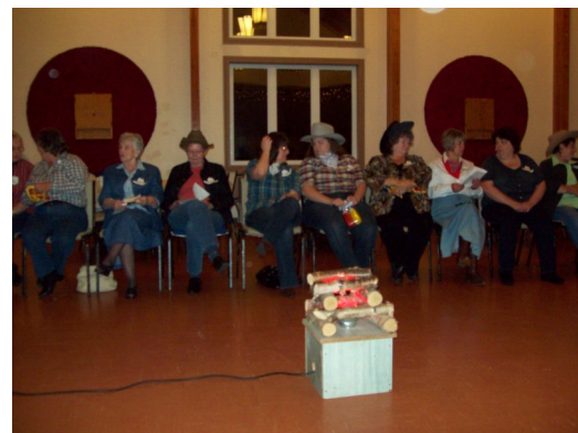
Home League Round-up Time