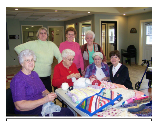
Ladies from New Creations and Residents at the Admiral's Coast Retirement Home preparing items for Janeway Children's Hospital and cancer patients.