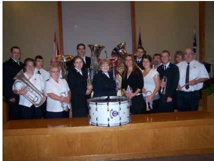
The Senior Band continues to grow. Some members were missing when this photo was taken.