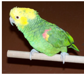
Special Guest: 12 year old Pepper, A double yellow headed Amazon Parrot.