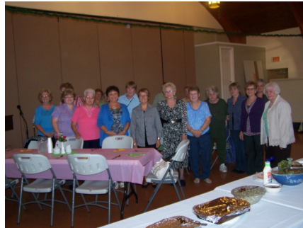
Women's Ministry began the year with a Pot Luck Dinner. All Ladies are welcomed to join them.