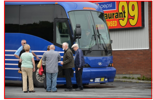
The 50 Plus Group began their year with a trip to Carbonear, and of course, dinner along the way.

Join us Saturday, October 20, 2012, (7.00 pm) for a CBS Corps Band Concert Celebration.