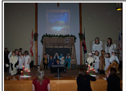
The Primary children present their version of the Christmas program "Miracle in the Manger". There were about 300 in attendance.