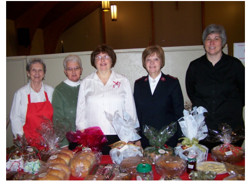
The Women's Ministry Annual Fall Sale and Luncheon was a great event. There was something for everybody. With lots of work and tremendous support, income amounted to over $6000.00. Congratulations ladies and thank you to all who supported them.