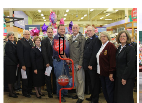
Launching of the Christmas Kettle Campaign for 2015 at Sobey's Store in Long Pond